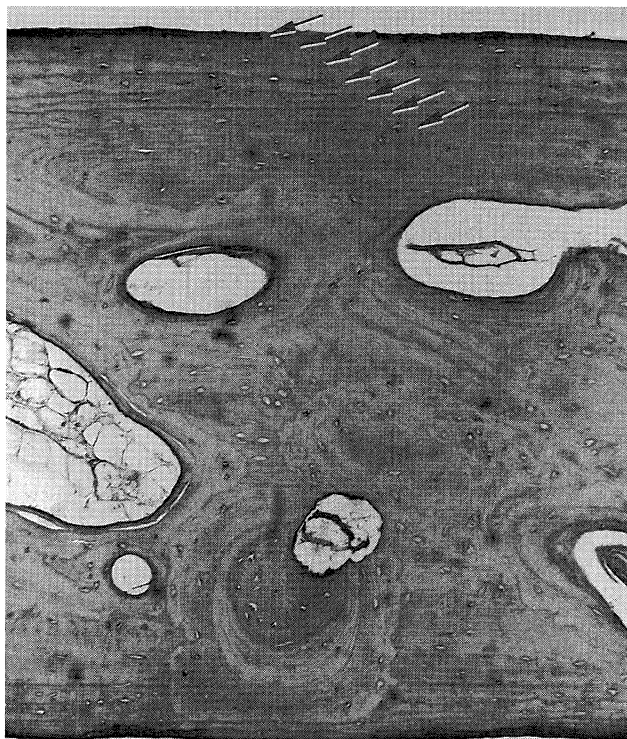
Figure 2. A cross-section of a sclerotic ossicle of Dermochelys coriacea (USNM 317614, 146.5 cm CCL) showing seven MSGs (marks of skeletal growth). Arrows point to LAGs (lines of arrested growth). This individual is estimated to have been 16.3 yr old at the time of its death.

Skeletochronological studies of sea turtles must inevitably address bone resorption and remodeling, because all